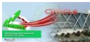
Oracle Corporation announced fiscal 2019 Q1 results