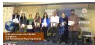
ICRC joins hands with CEJ-IBA to organize 2nd Humanitarian Reporting Awards