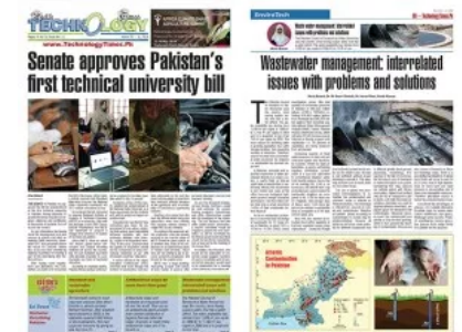
Volume 09 Issue 13 March 26, 2018 - No Comment