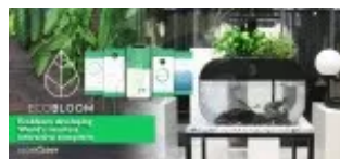
Ecobloom developing World's smartest interactive ecosystem