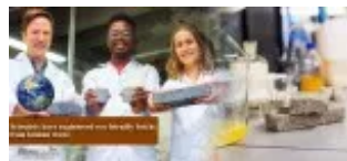
Scientists have engineered eco-friendly bricks from human waste