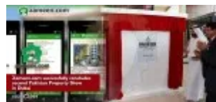
Zameen.com successfully concludes second Pakistan Property Show in Dubai